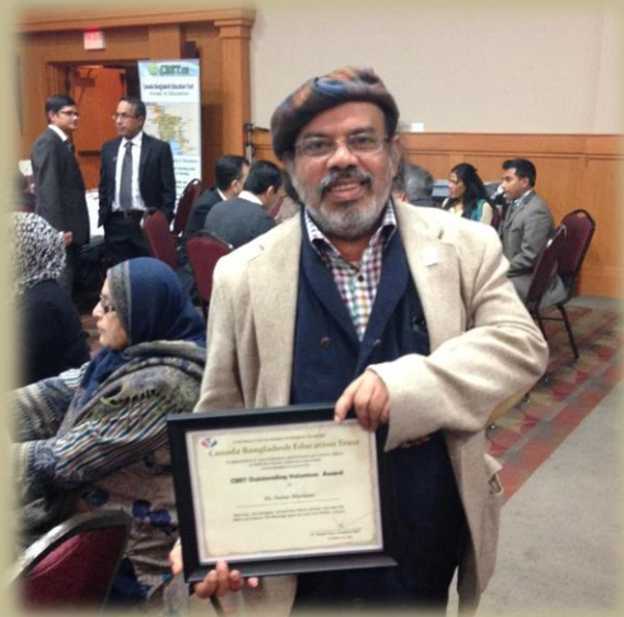
CBET Community Award recipients